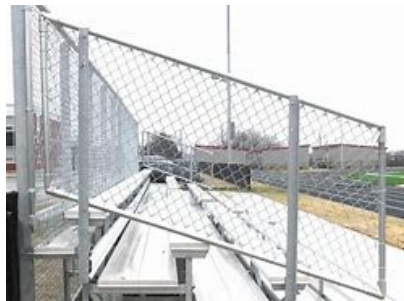
Chain-Link-Fence Guardrail Example

Answer: Chain-link-fence guardrails are required as part of the base bid. The City would like prospective bidders to also provide an alternative additional cost to install vertical-picket-fence guardrails in lieu of the chain-link-fence guardrails.