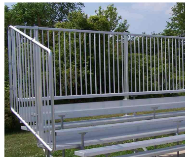
Vertical-Picket-Fence Guardrail Example

Whether the vertical-picket-fence guardrails are to be installed instead will be at the Recreation and Parks Department's discretion.